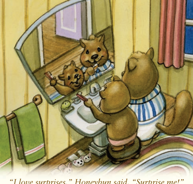
"I love surprises," Honeybun said. "Surprise me!"